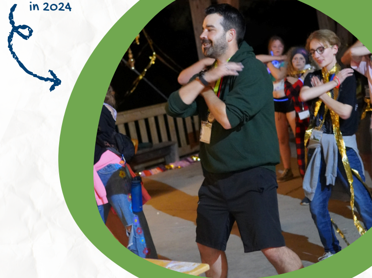
& still volunteering in 2024